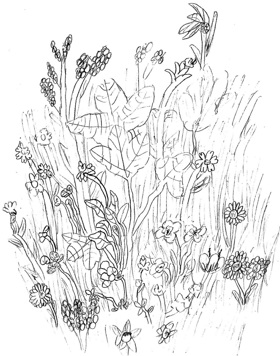
All illustrations are by year 6 pupils from Hunny Hill Primary School